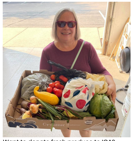
Want to donate fresh produce to ICA? Please bring it to our central food shelf location: 11588 K-Tel Drive, Minnetonka.

Please consider sharing your harvest and supporting local families! Whether you plant an extra row for ICA or just share your garden's bounty as it arrives, home-grown produce is an incredible joy to share. We accept any size donation. Whether its a handful of cherry tomatoes or a bushel of apples, your donation will be an amazing gift! All sorts of vegetables, herbs and fruits are welcome.