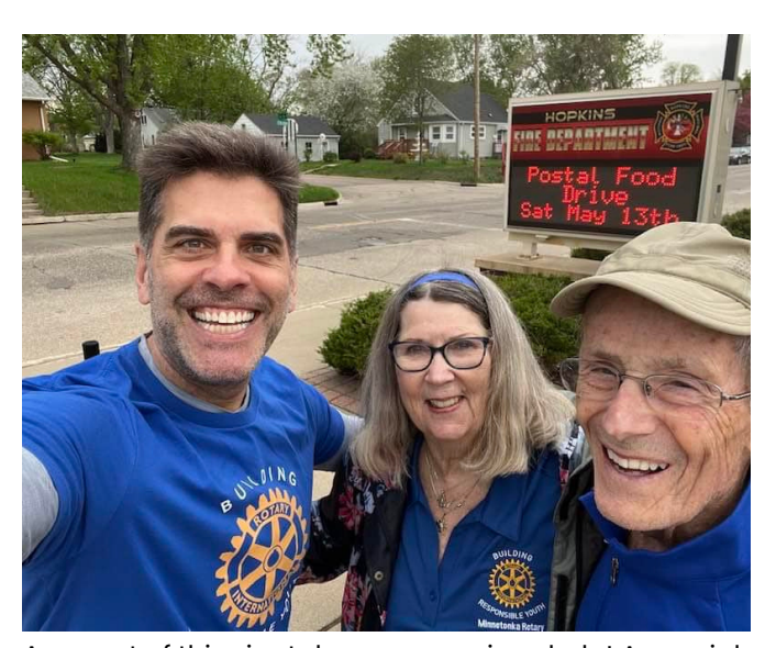
An event of this size takes some serious help! A special thank you to Minnetonka Rotary (pictured above), Priority Courier Experts, Groves Learning Organization and so many amazing individuals for your assistance.

Thank you so much to everyone who participated or helped spread the word about this incredible event.