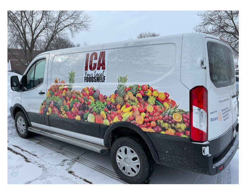
In late October 2021, local Rotarians raised the funds for ICA to purchase another delivery vehicle. This van is instrumental for the growth of our home deliveries.

Of course, none of these new, exciting initiatives would be possible without your continued support. We rely on the generosity of our supporters to meet the ever-changing needs of our neighbors. Now, more than ever, a gift to ICA will help members of our community find long-term stability.