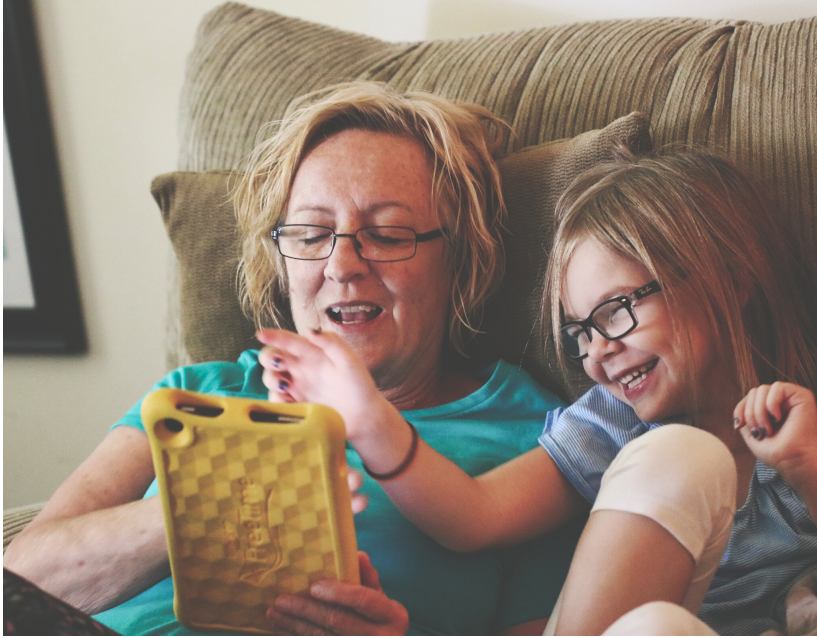
Ellen* recently took over caring for her two grandchildren and needed help when her work hours were reduced