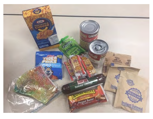
Kids' Bags include kid-friendly food and snacks, plus handmade kids' masks donated by ICA supporters

-- Hopkins Elementary School Social Worker